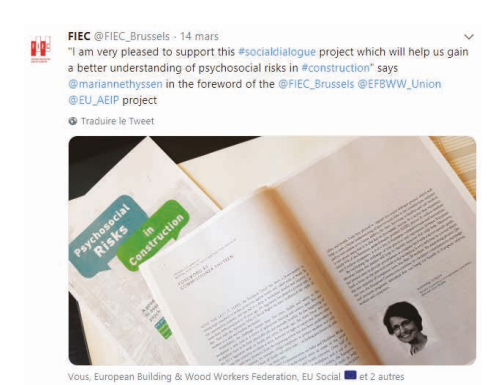
Foreword of EU Commissioner Marianne Thyssen supporting the project

The aims of the project were therefore to exchange best practices and map prevention tools and methodologies that exist in various Member States and on that basis to develop guidelines to help employers have greater understanding on dealing with such risks at the workplace.