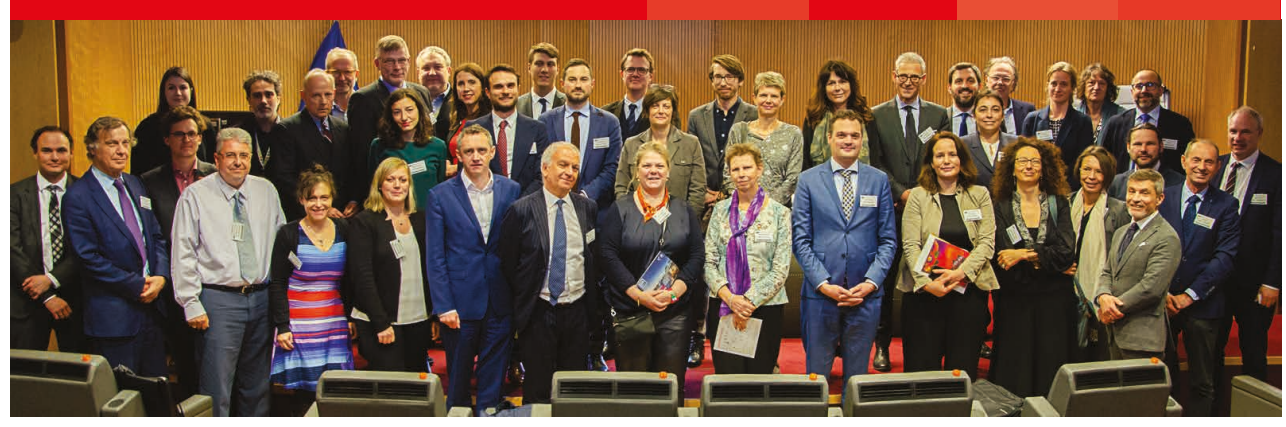
High Level Forum meeting on 4/4/2019, Brussels

"The construction industry is very important to the EU economy. The sector provides 18 million direct jobs and contributes to about 9% of the EU's GDP. It also creates new jobs, drives economic growth, and provides solutions for social, climate and energy challenges. The goal of the European Commission is to help the sector become more competitive, resource efficient and sustainable." (DG GROW). Following Commission VP Tajani's preview at the FIEC Congress 2012 in Istanbul, actions were addressed in the High-Level Forum, 5 Thematic Groups and studies: 1 Stimulate investment; 2 Skills & Qualifications; 3 Sustainable use of natural resources; 4 Internal Market; 5: International competitiveness. Currently, discussions focus on priorities for