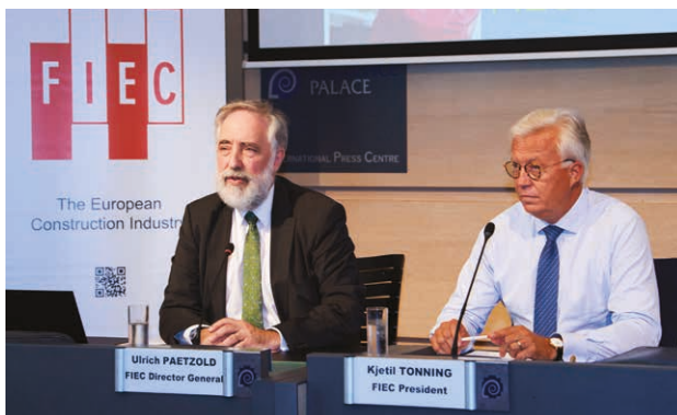
FIEC Press Conference 20/6/2018, FIEC President and DG present the FIEC/ EIC position on the issue.

FIEC and EIC are in favour of genuinely reciprocal market access opportunities and corresponding incentive measures (i.e. trade defence instruments) at EU level, if international negotiations do not achieve tangible progress.