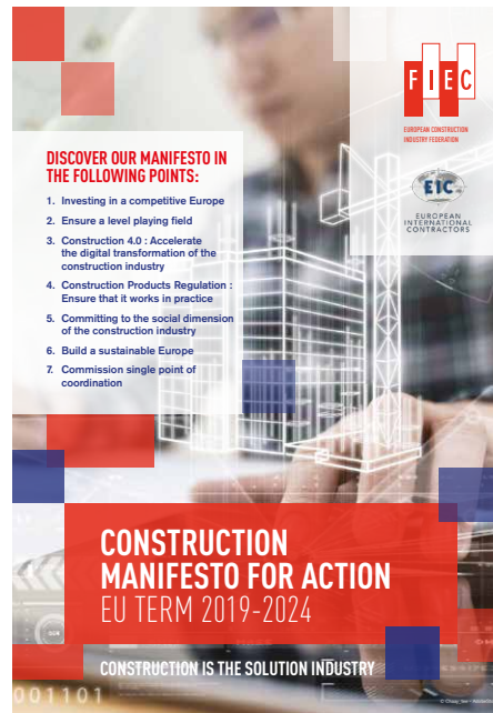
FIEC Manifesto for EU Term 2019-2024