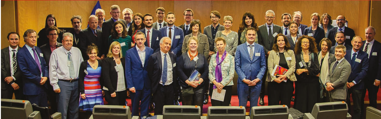
High Level Forum meeting on 4/4/2019, Brussels

“The construction industry is very important to the EU economy. The sector provides 18 million direct jobs and contributes to about 9% of the EU’s GDP. It also creates new jobs, drives economic growth, and provides solutions for social, climate and energy challenges. The goal of the European Commission is to help the sector become more competitive, resource efficient and sustainable.” (DG GROW). Following Commission VP Tajani’s preview at the FIEC Congress 2012 in Istanbul, actions were addressed in the High-Level Forum, 5 Thematic Groups and studies: 1 Stimulate investment; 2 Skills & Qualifications; 3 Sustainable use of natural resources; 4 Internal Market; 5: International competitiveness. Currently, discussions focus on priorities for a possible follow-up action from 2020.”