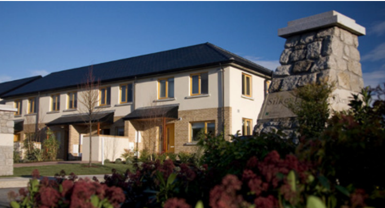
CASE STUDIES 1 AND 2: Madeira Oaks (left) and Silken Park

CASE STUDY 1: Housing development 'Madeira Oaks' in Moyne, Enniscorthy, Wexford. Phase 2 of the project clearly meets current the NZEB definition at an A1 BER with low U-values, MVHR, on-site renewable heat (extract air heat pump) and renewable electricity (photovoltaics). For an excellent descriptive and technical analysis of the Enniscorthy project see the online video: https://phai.ie/info/passive-house-nzeb/7-steps-nzeb/