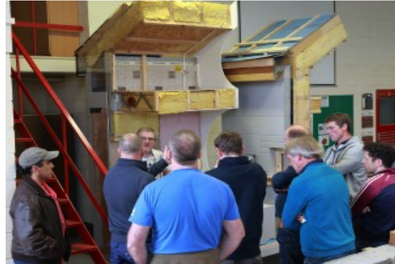
QualiBuild Training Workshop, Dublin