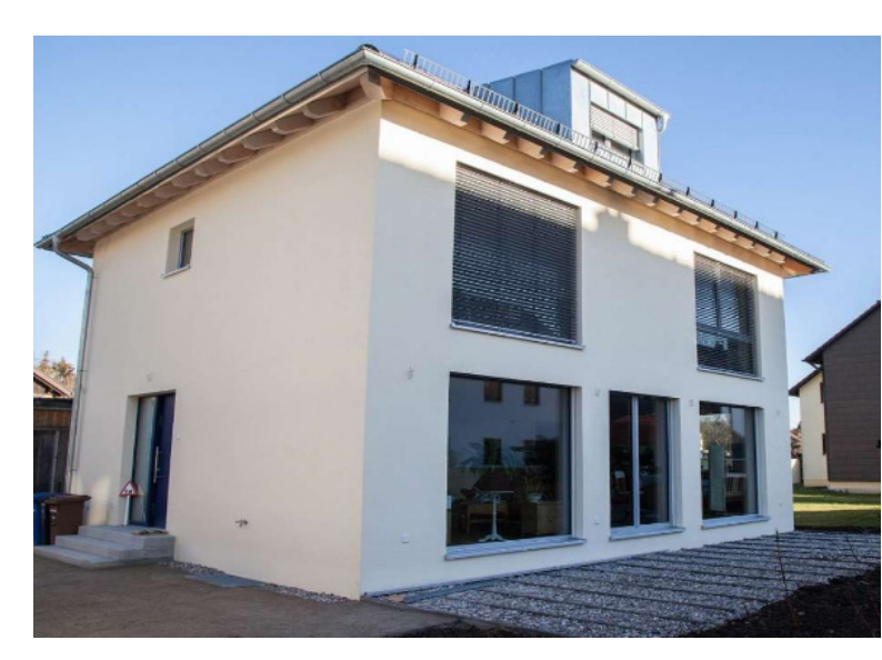
CASE STUDY: Detached single-family house in Munich

Because the building is a certificated PH, the quality of work would have been documented throughout to ensure meeting PH standards. The construction company is mature, the prefabricated timber frame design is in-house, and one of the directors is a master carpenter.