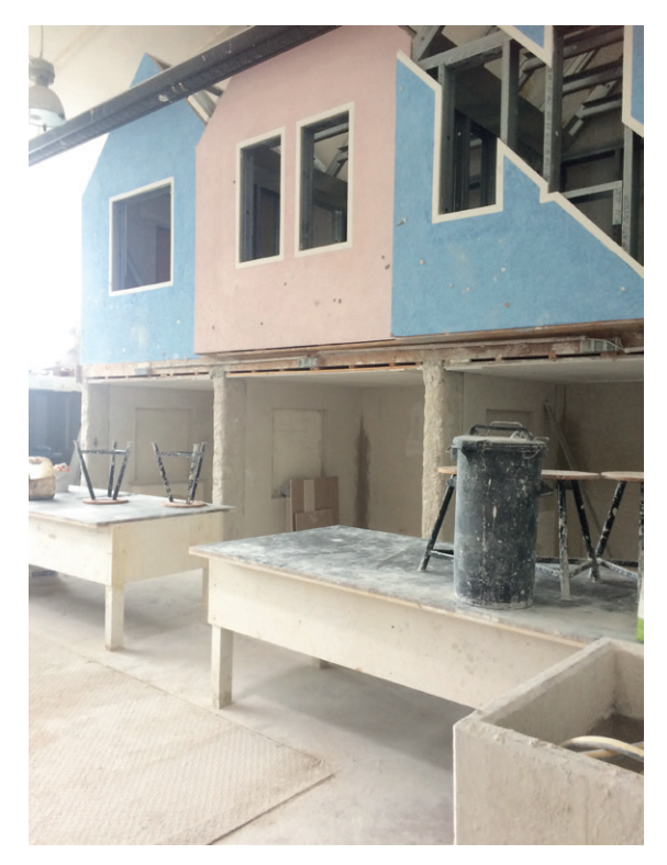
Plasterers' Training College, Stuttgart

The College encompasses both the Berufschule or Vocational College and the Überbertriebliche Ausbildungsgstätte or Training Centre, though elsewhere in Germany both may be in different locations. The Stukkateur (plasterer) is a broad occupation, including plastering, screeding, rendering, decorative work and dry and wet wall construction. In southern Germany, gypsum has a long tradition; in other regions plastering is more specialised. The plasterer is a Handwerk occupation, one of the Bauhauptgewerbe (principal construction occupations) alongside the carpenter, mason and plasterer, which come together in the Training Centre. Vocational education and training (VET) is completed over three years, with theoretical elements covering: knowledge of the subject, including materials and technique; and general education, including technical maths,